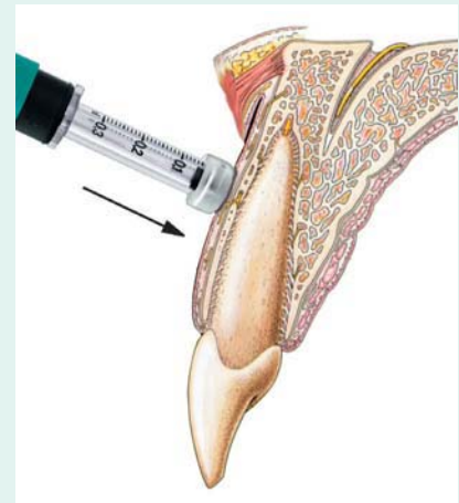
Positioning of the injector on the attached gingiva of a front teeth

Sufficient anaesthesia is achieved with comparably low doses. This is especially important with children who have a lower dose limit. The total required amount of local anaesthesia is even further reduced due to the extended effective window and the targeted anaesthetising of the individual tooth. Consequently, reduced doses are necessary to anaesthetise patients in general (SALEH et al., 2002).